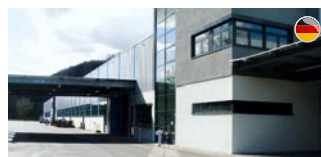
ARNOLD UMFORMTECHNIK Ernsbach Germany