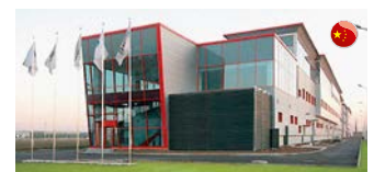
ARNOLD FASTENERS SHENYANG Shenyang China

ARNOLD FASTENING SYSTEMS Inc. 1873 Rochester Industrial Ct., Rochester Hills, MI 48309-3336 USA T +1 248 997-2000 F +1 248 475-9470