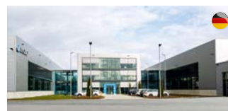
ARNOLD UMFORMTECHNIK Dörzbach Germany