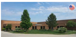
ARNOLD FASTENING SYSTEMS Rochester Hills USA